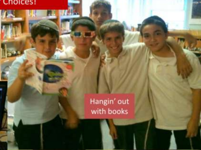
Hangin' out with books