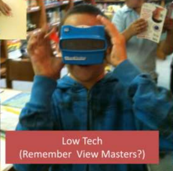
Low Tech (Remember View Masters?)