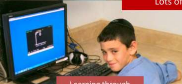
Learning through games