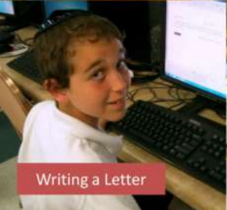
Writing a Letter