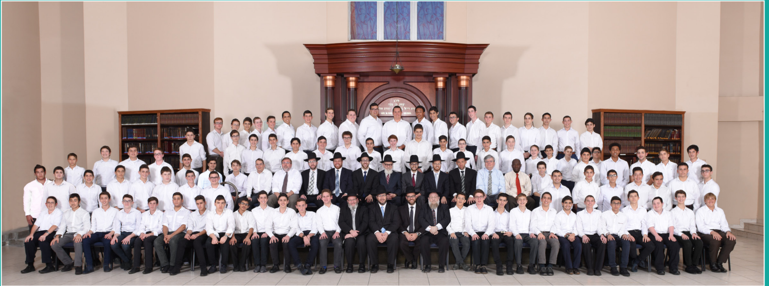
DR. ABE CHAMES HIGH SCHOOL