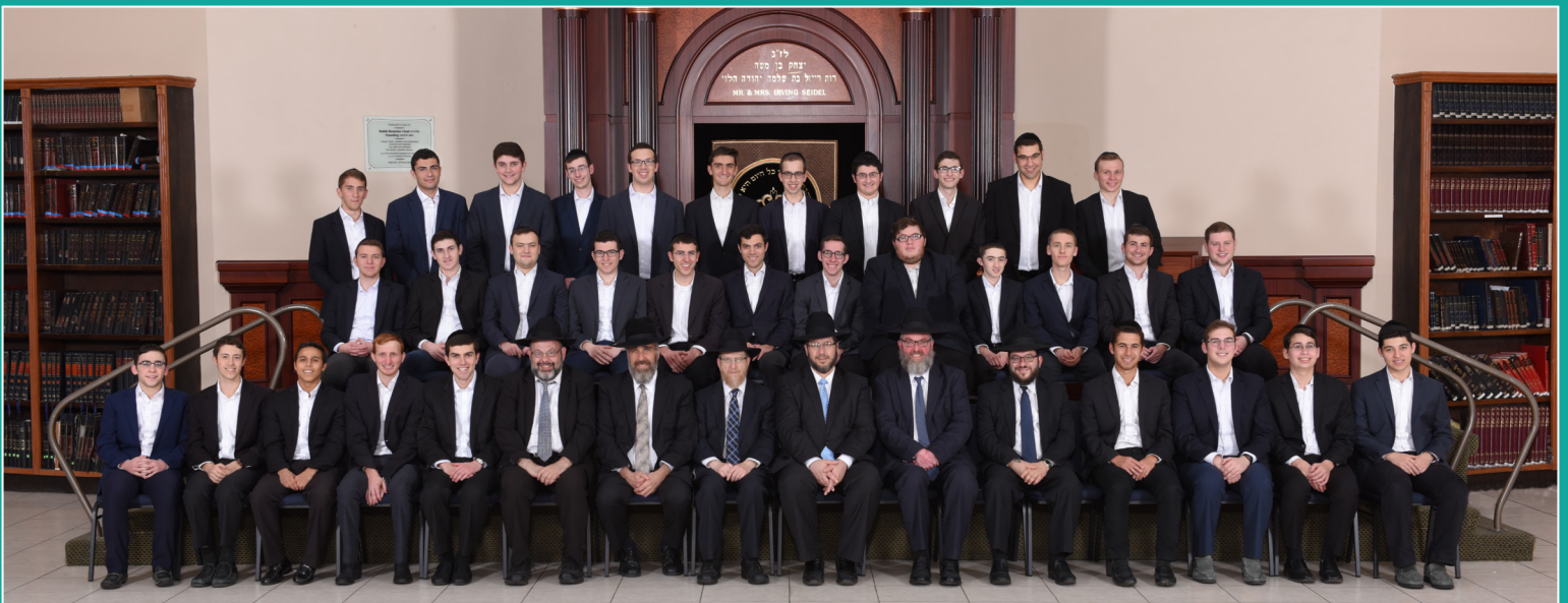
BAIS MEDRASH ZICHRON EZRA