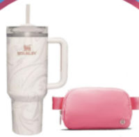
PRIZE 3: Stanley Cup and Lululemon Fanny Pack