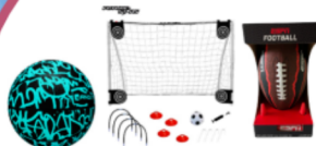
PRIZE 6: Sports Package