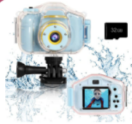
PRIZE 2: Underwater Camera