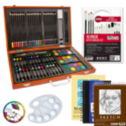
PRIZE 5: Deluxe Art Creativity Package