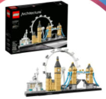
PRIZE 4: Lego Architecture Set