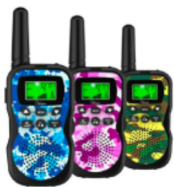
PRIZE 9: Walkie Talkies

To register for camp and for more information visit our website at www.MachaneMiami.org or call 786-506-9071