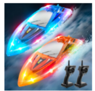
PRIZE 8: Remote Control Boat Set