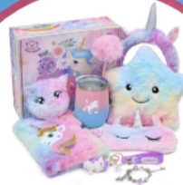
PRIZE 7: Unicorn Package