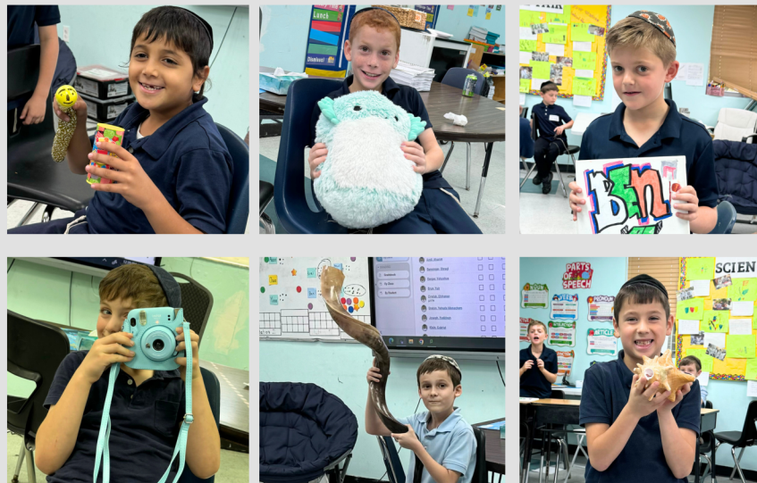
To practice public speaking, 2B-3 and 2B-4 had show-and-tell.