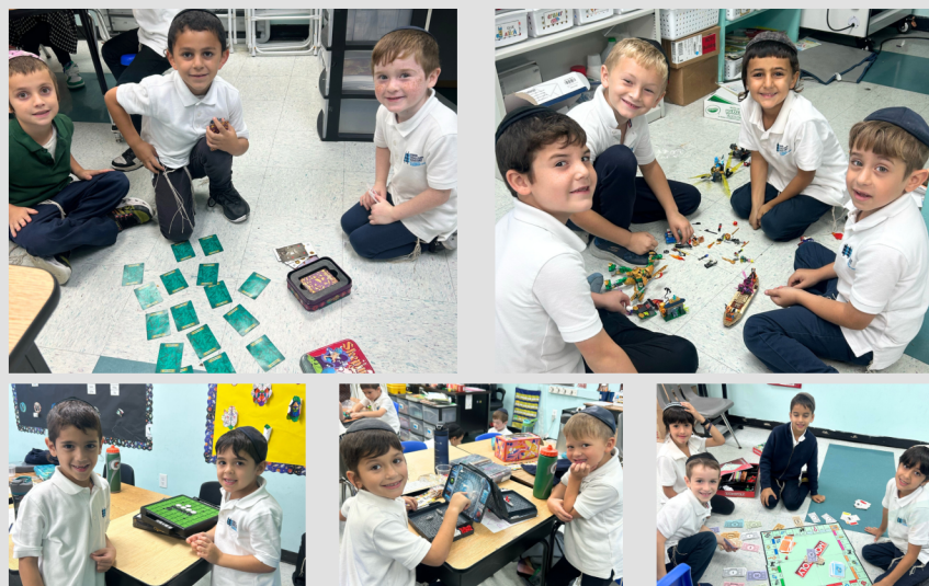
1B-3 had game day in honor of completing their first math book, ending with Chapter 5.