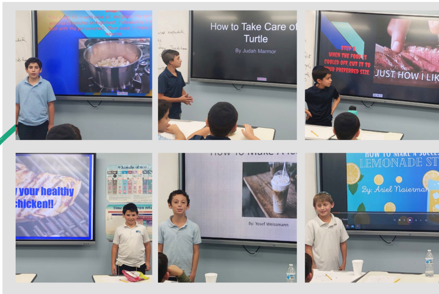
Students in 5B-2 and 5B-3 gave how-to presentations.