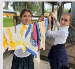
Our fifth grade girls had a great time on their trip to the Old Davie School Historical Museum.