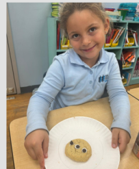
The girls in 1G-2 had fun practicing their new nekuda- "Koobootz on a Cookie"!