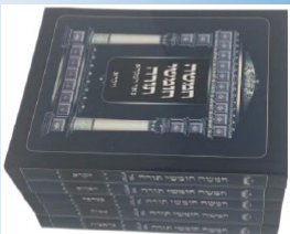
2A. POCKET SIZE CHUMASH