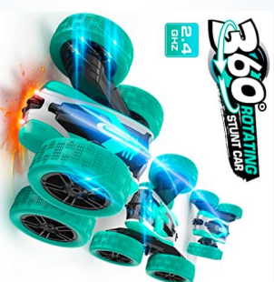
3B. REMOTE CONTROL CAR